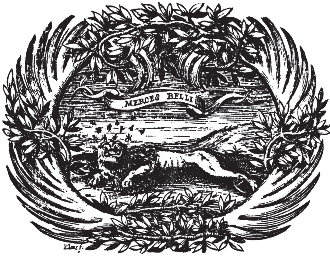
Fig. 4. Diego Saavedra Fajardo, Empresas políticas : empresa 99. (edited by Quintín Aldea Vaquero) Madrid, Editora Nacional, 1976, p. 901.